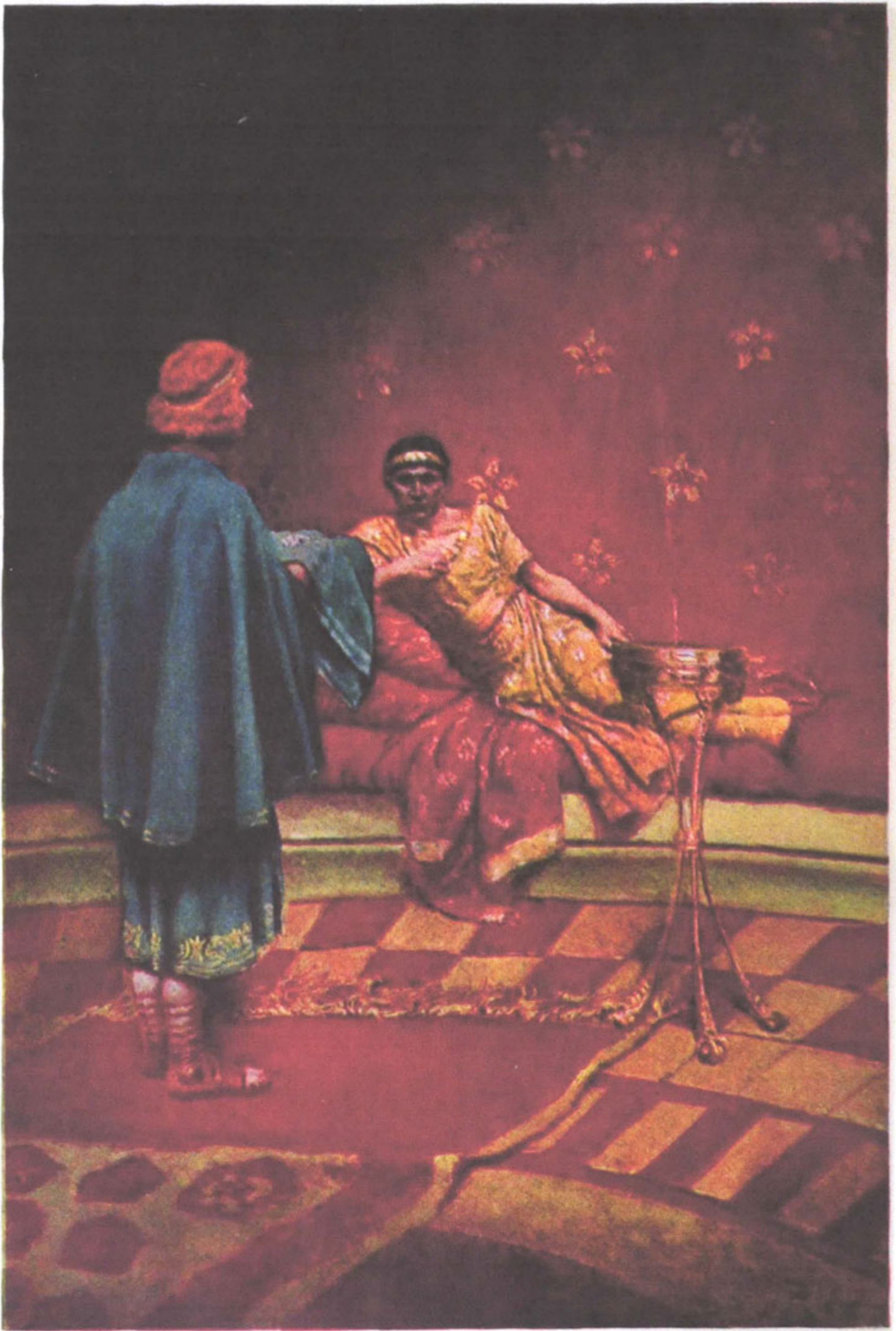
Painting by Howard Pyle