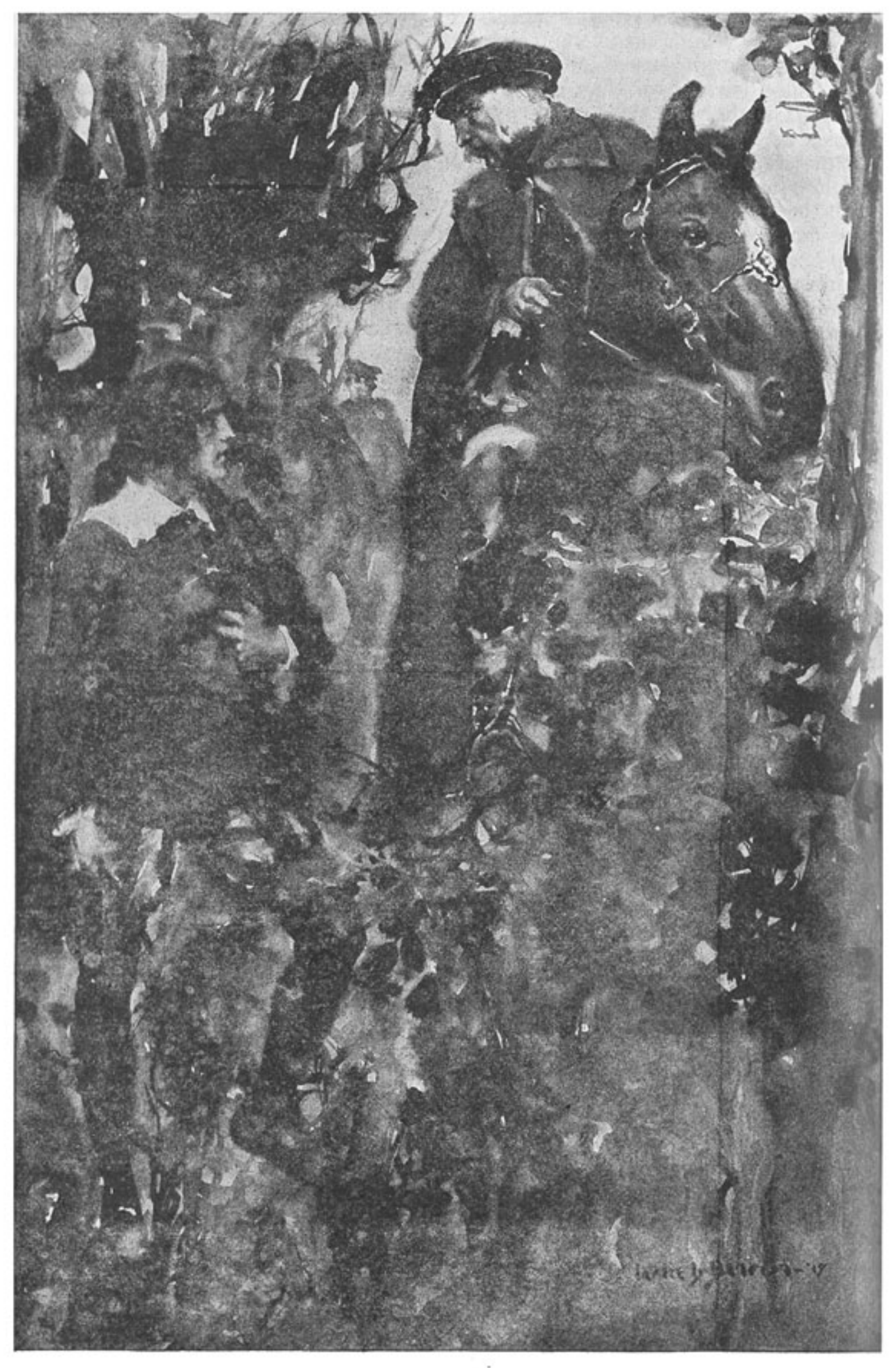
"'All persons who dispute our prophecies are burned at the stake'"