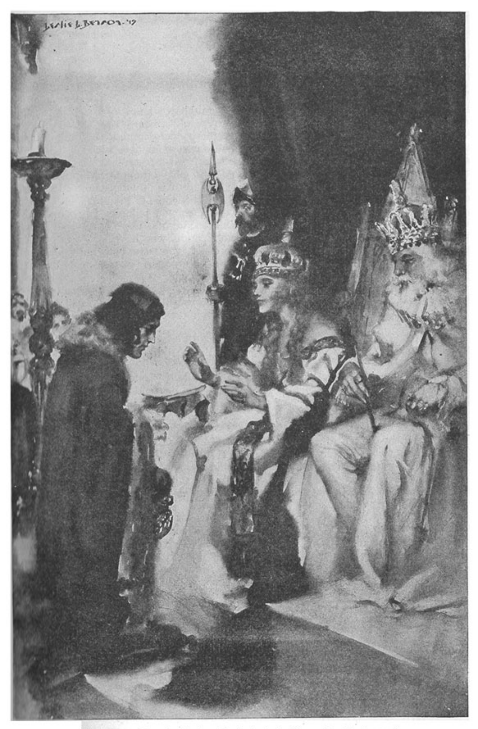
"So he gave her the feathers he had plucked from the third goose"